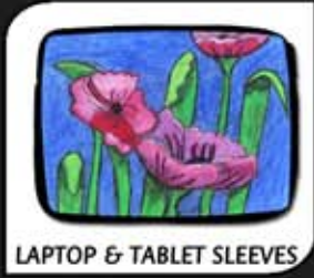
LAPTOP & TABLET SLEEVES