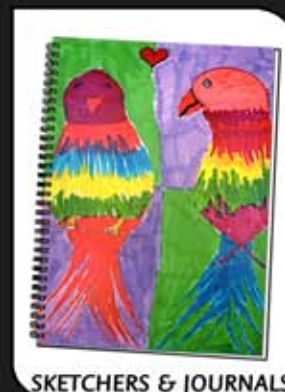
SKETCHERS & JOURNALS