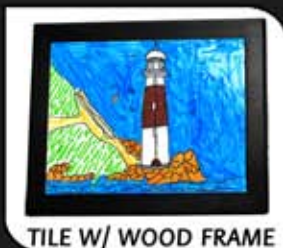
TILE W/ WOOD FRAME

FULL IMAGE ON FRONT, PRINTED ON HIGH QUALITY WATERPROOF LAMINATE. WIRE BOUND, OVER 100 PGS.