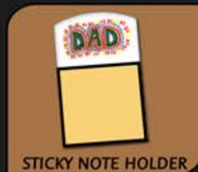
STICKY NOTE HOLDER